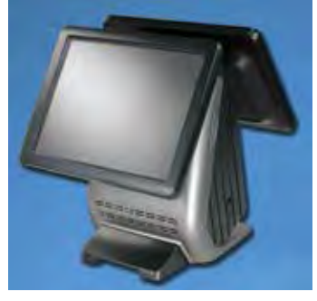
Optional Integrated 15" LCD Customer Display