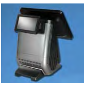
Optional Integrated 7" LCD Customer Display