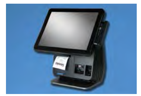
Card Reader / Printer / Scanner + Fingerprint Reader