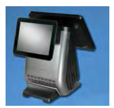
Optional Integrated 9.7" LCD Customer Display