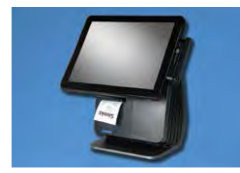
Card Reader / Printer