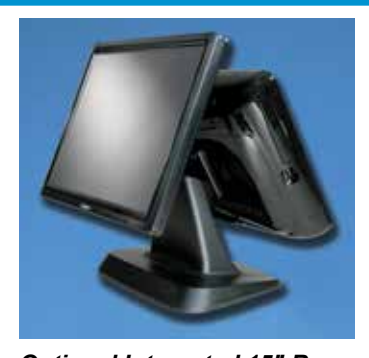
Optional Integrated 15" Rear LCD Customer Display