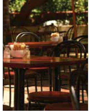
Bars / Ice Cream Parlors / Restaurants