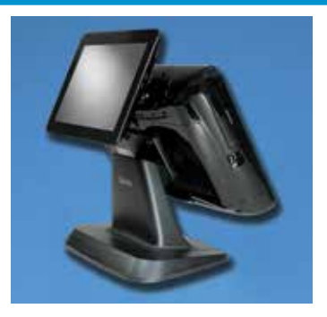
Optional Integrated 9.7" Rear LCD Customer Display