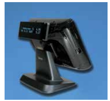
Optional Integrated Rear VFD Customer Display