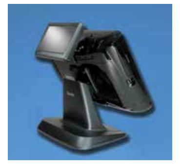
Optional Integrated 7" Rear LCD Customer Display