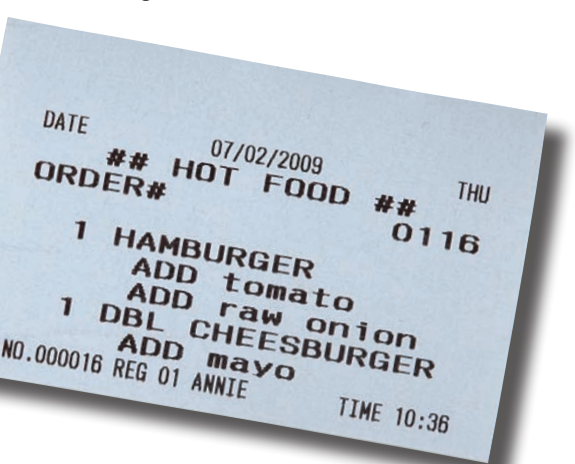
Kitchen requisition printed by the SPS-530 80mm receipt printer shown 75% actual size.

SPS-500 series ECRs can be connected in a fast and reliable Ethernet-style network. Networking supports report data consolidation, ECR programming, payment authorizations, polling, plus printer and video requisition routing.