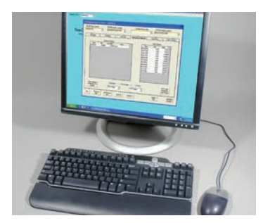
Polling and Inventory Software

Enjoy the advantages of scanning - price control, item movement reporting and labor savings.