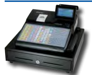
SPS-320 Flat, Spill-Resistant Keyboard; Receipt Printer